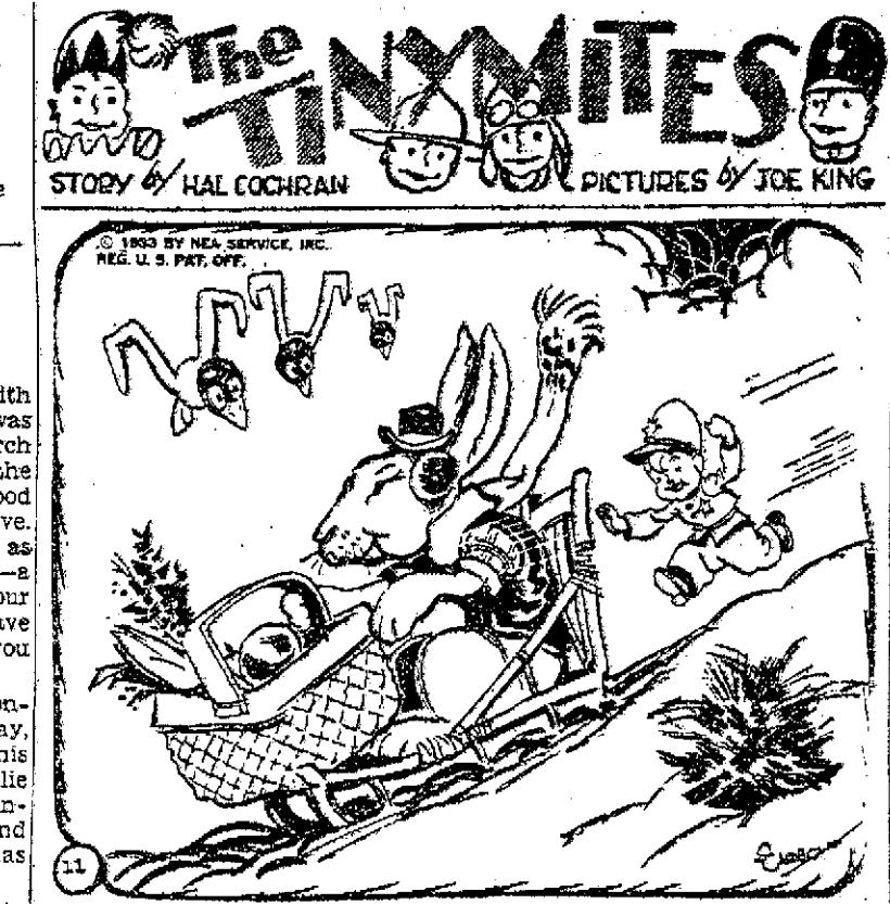
(READ THE STORY, THEN COLOR THE PICTURE)

Now the funny money idea bobs up again, the bills that would not be good unless you pasted on a 2-cent stamp before you used them.